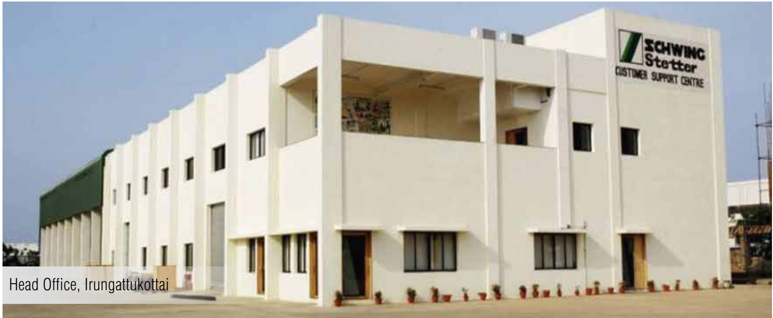
Head Office, Irungattukottai